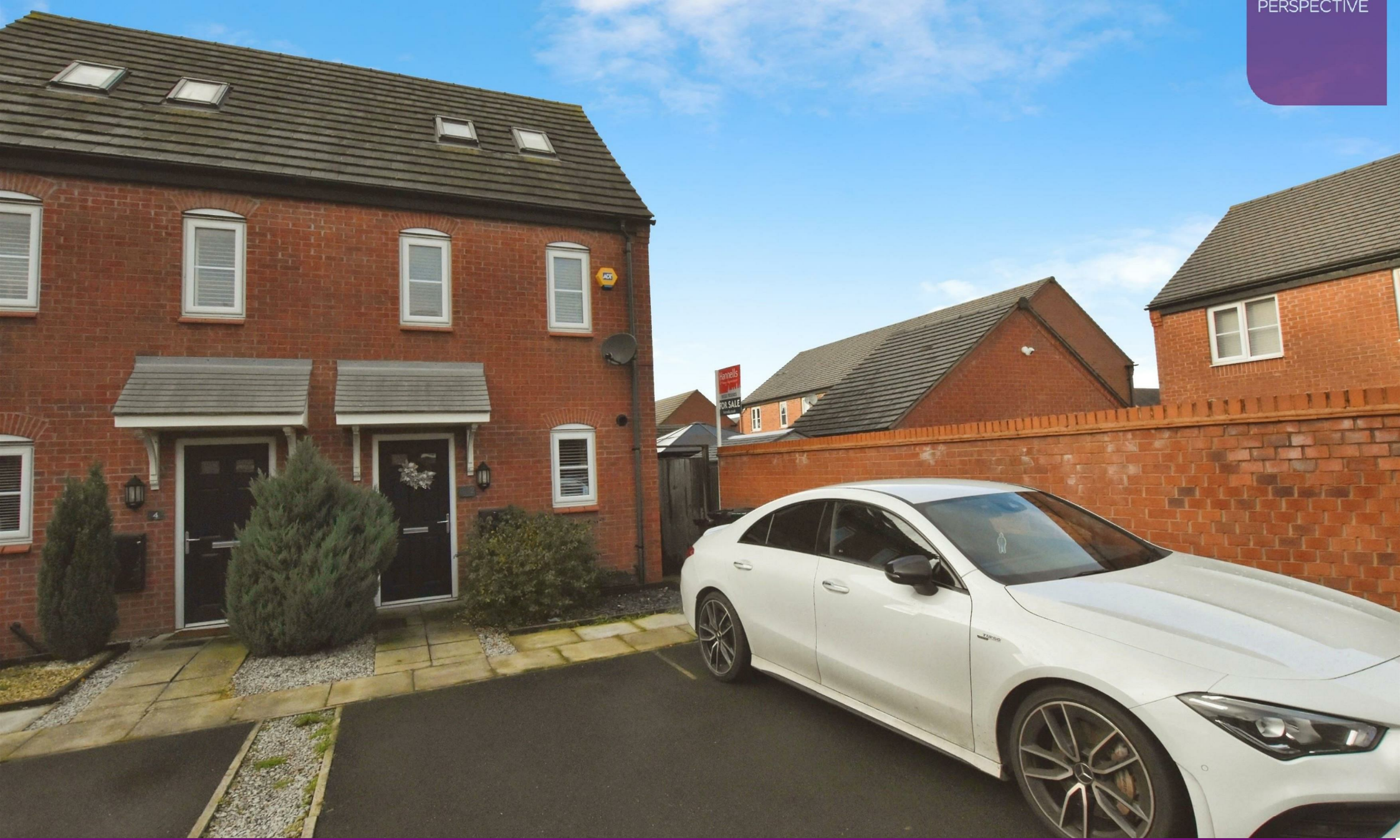
2 Netley Road, Boulton Moor, Derby, DE24 5BB £209,950